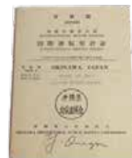
International driving permit based on the Geneva Convention of 1949