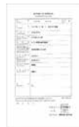
Official translation of driving license

③ For nationality whose country is signatory to Geneva Convention of 1949 . → You may drive by presentation of all of following documents.