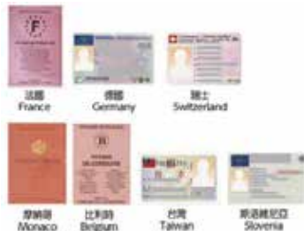
Driving license issued by each country/region