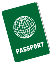
Passport or Landing permit for cruise ship tourists